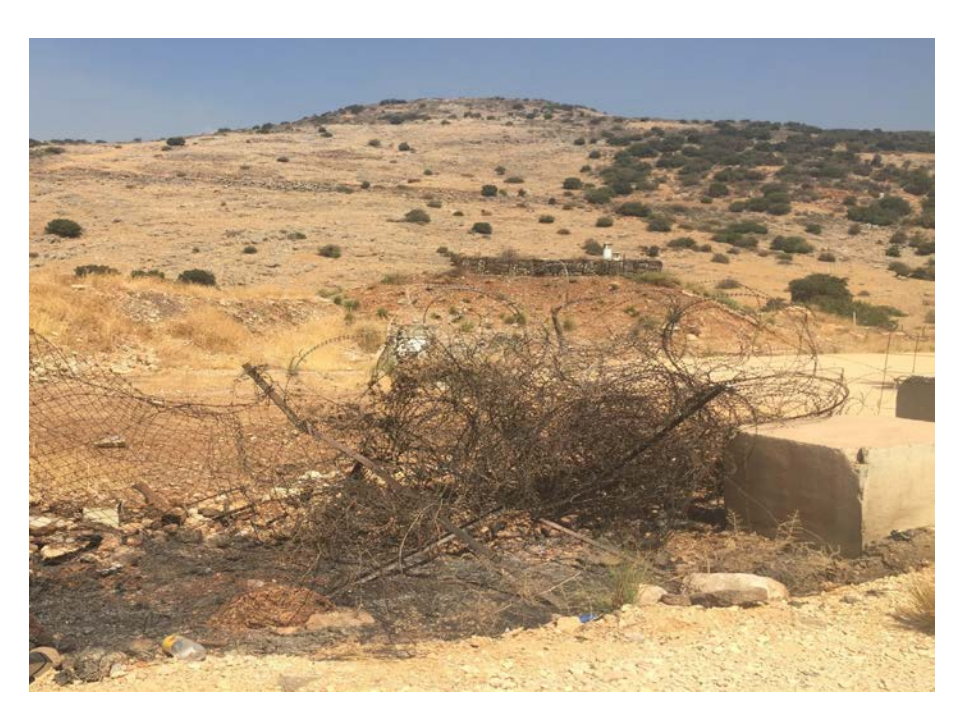
A broken fence surrounding a minefield

Even though many minefields in the Golan are marked, they continue to pose a grave danger to the villagers who live and work near them. On February 11, 2008, the Peace Court of the city of Haifa ordered the Israeli government to award NIS62,240 (USD $14,939) to compensate two brothers in Majdal Shams for the injuries they sustained in 2000, when landmines swept down a hill from a minefield into their courtyard. The court concluded that the Israeli Army was aware of the dangerous positioning of the mines but took no preventive measures. <sup>80</sup>